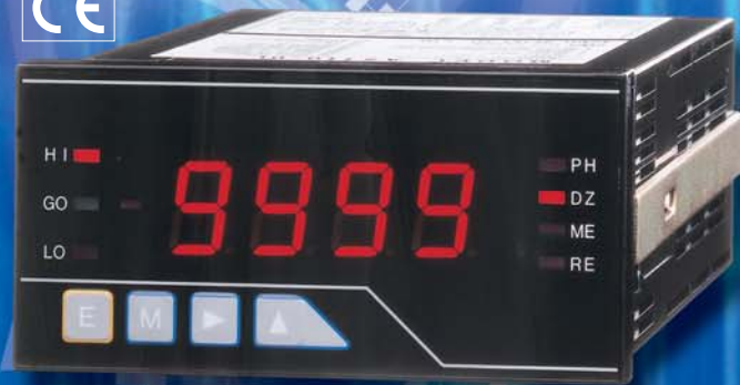
Display single type (A5X1X-XX)