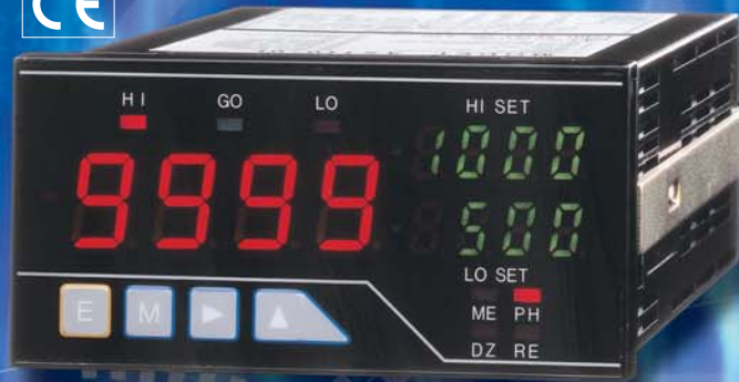
Display multiple type (A5X2X-XX)